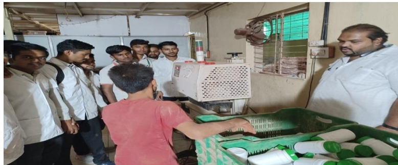
Figure 4 INDUSTRIAL VISIT to ASHTANG AYURVED PHARMACY on 5th MAY 2022

Signature MS Ashtang Ayurved Dhule Astang Ayurved Pharmacy M. I. D. C. Avadhan, Dhule.