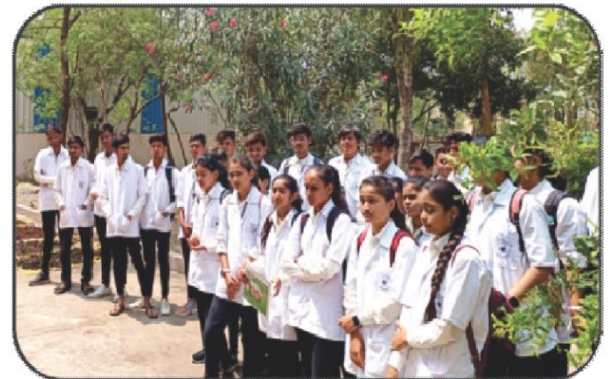
Figure 2 Industrial Visit to Dream Herbal Company, MIDC, Dhule on 17 th March 2023