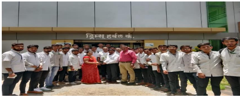
Figure 5 Photographs of Industrial Visit To Dream Herbal Company On 5 th May 2022