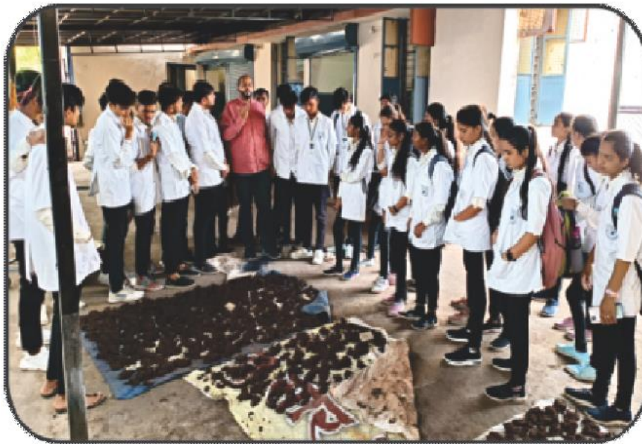
Figure 1 Photographs of Industrial Visit to Ashtang Ayurved Pharmacy on 17 th March 2023